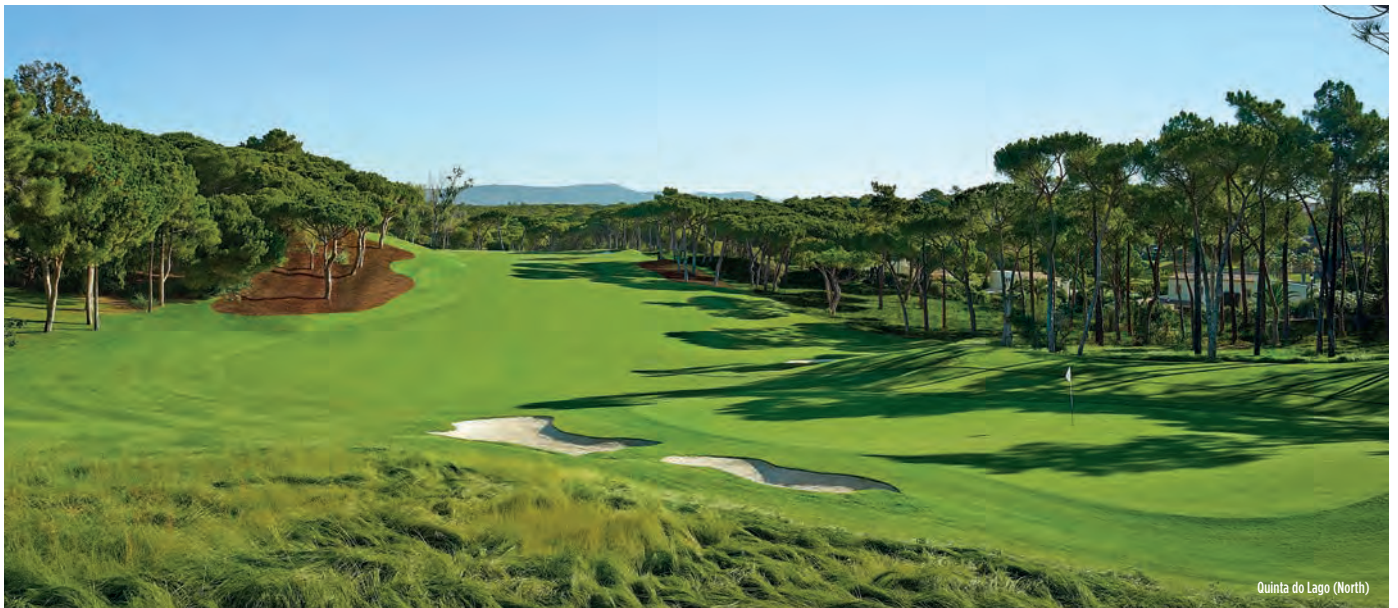
Quinta do Lago (North)

The small town of Almoncil is dominated by two of the Algarve's most impressive resorts – Vale do Lobo and Quinta do Lago. They both offer various kinds of luxury accommodation, high-class food in a myriad restaurants, superb beaches and of course excellent golf. Several smaller towns surround these 'super resorts', which are so comprehensive.